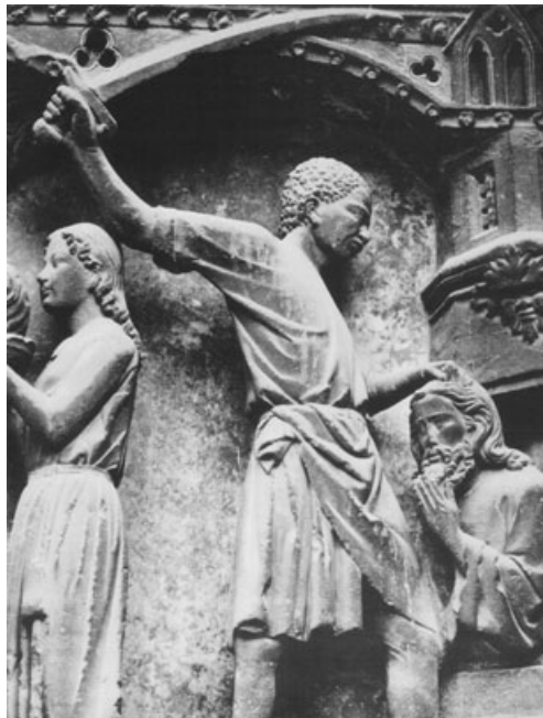
Fig. 1. African Executioner of John the Baptist. Cathedral of Notre Dame, Rouen: tympanum, north portal, west façade, c. 1260.

A carved tympanum on the north portal of the west façade of the Cathedral of Notre Dame in Rouen (c. 1260) depicts the malevolent executioner of the sainted John the Baptist as an African phenotype (Fig. 1), while an illustration in six scenes of Cantiga 186 of Las Cantigas de Santa Maria , commissioned by Alfonso X of Spain between 1252 and 1284, performs juridical vengeance on a black-faced Moor who is found in bed with his mistress; both are condemned to the flames, but the fair lady is miraculously saved by the Virgin Mary herself (Fig. 2). Black is damned, white is saved. Black, of course, is the color of devils and demons, a color that sometimes extends to bodies demonically possessed, as demonstrated by an illustration from a Canterbury psalter, c. 1200 (Fig. 3). In literature, black devilish Saracen enemies – sometimes of gigantic size – abound,