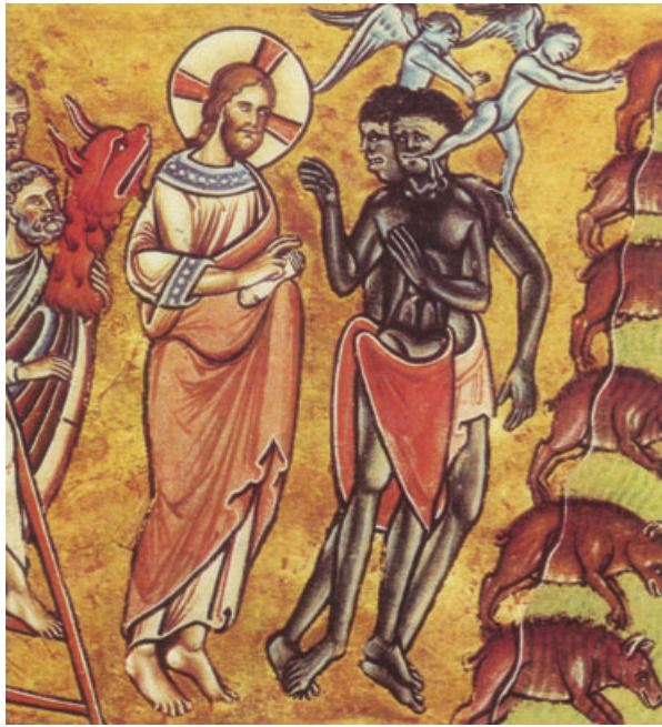
Fig. 3. Healing of the Gadarene demoniacs. Psalter, fol. 3 v (detail). From Canterbury, about 1200.

of noble blood: ‘Als milk thair hide bicom sa quite/And o fre blode thai had the hew’ (‘Their skin became as white as milk/And they had the hue of noble blood’ [Morris ll. 8072, 8120–1]). Elite human beings of the 14th century have a hue, and it is white. The few examples I cite here from medieval England, Germany, France, and Spain – examples from state and canon law, chronicles and historical documents, illuminations, encyclopedias, architecture, devotional texts, rumor and hearsay, and recreational literature – form only a miniscule cross-section of the cultural evidence across the countries of Western Europe.